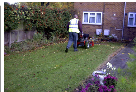
Manoeuvre in small areas