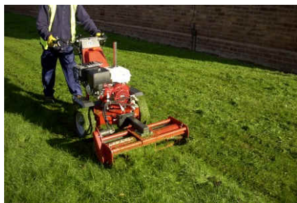
Deal with many grass conditions