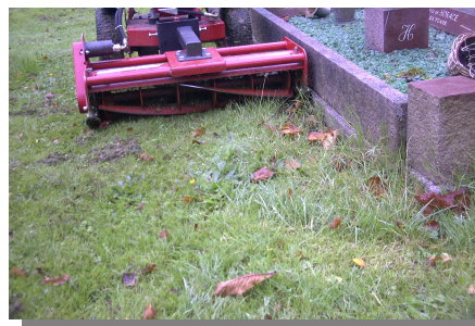
Mow close to obstacles