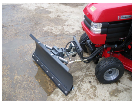
Snow Blade on FKDR available with manual lift and lower or hydraulic