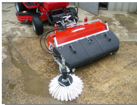
Front sweeper available with collector and side gully brush