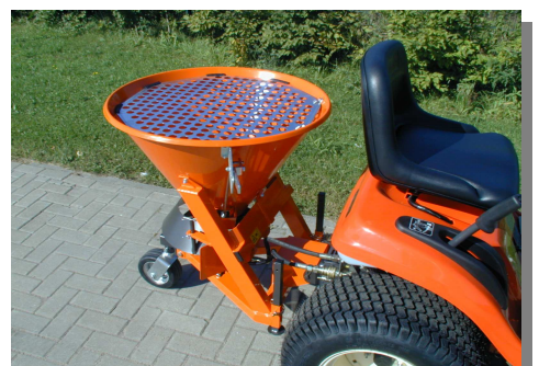
Salt, Sand & Grit Spreader with quick attach mounting system