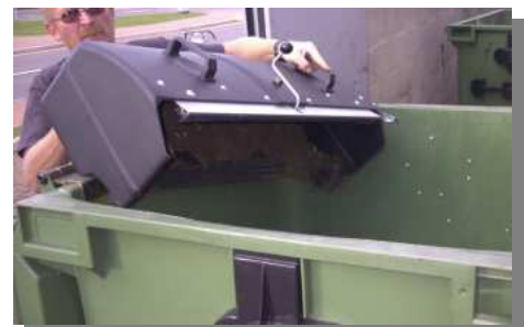
Emptying Collector Box