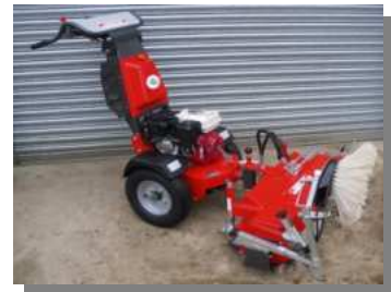
K-Line 1500pro with Sweeper