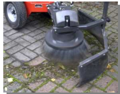
WeedBrush in Action