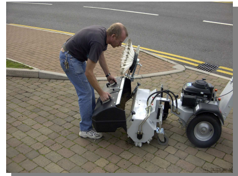
Removing Collector Box