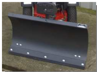
Snow Blade Attachment