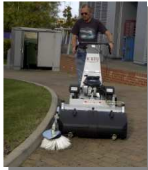
K-Line 820 Sweeper with Collector and side Gulley Brush